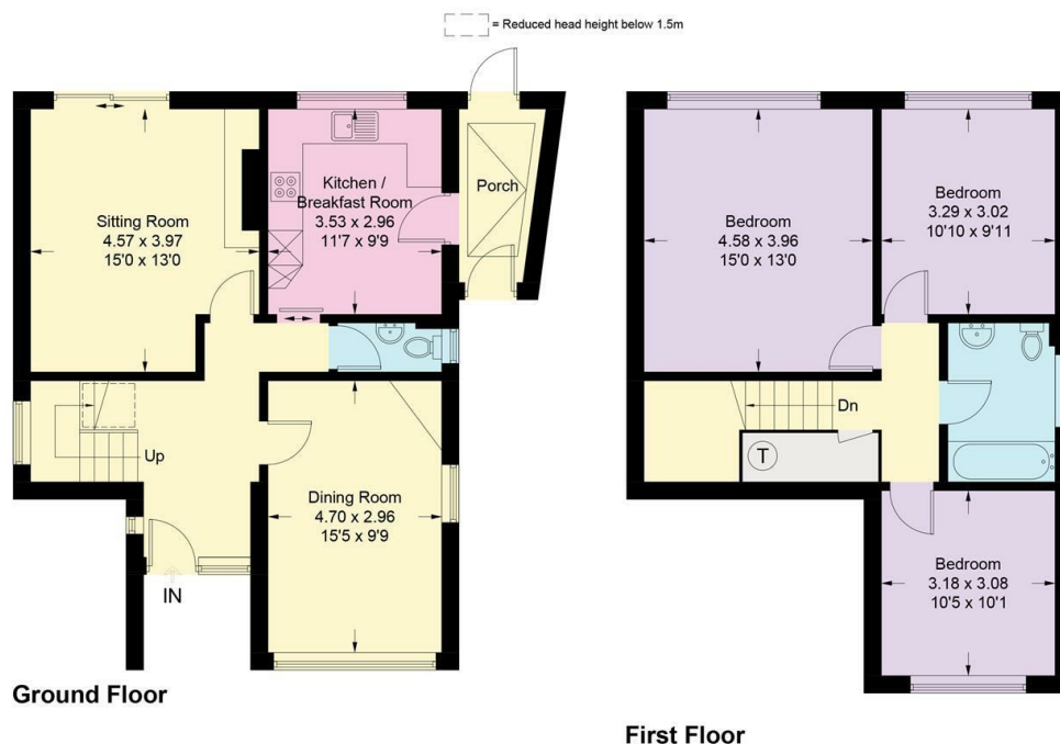
Illustration for identification purposes only, measurements are approximate, not to scale. Fourlabs.co © (ID1242671)

Approximate Gross Internal Area = 118.8 sq m / 1279 sq ft