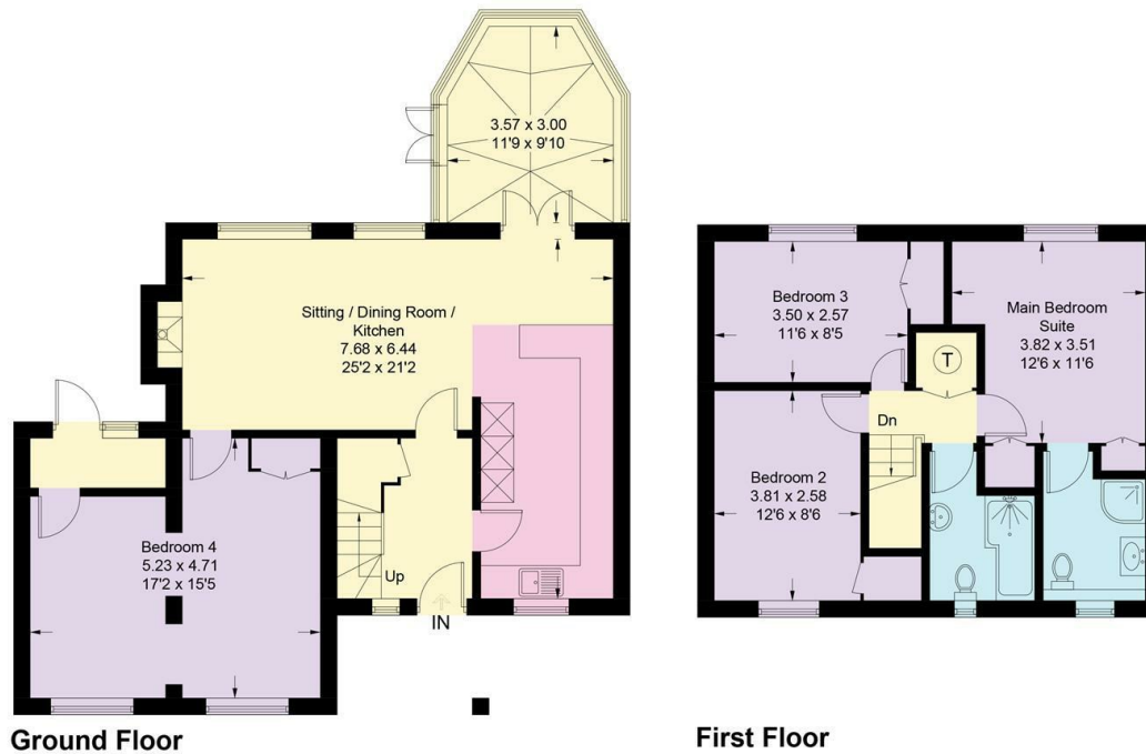
Illustration for identification purposes only, measurements are approximate, not to scale. floorplansUsketch.com © (ID1001270)

Approximate Gross Internal Area = 130.2 sq m / 1401 sq ft